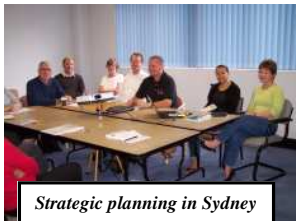
Strategic planning in Sydney

As I look back over the past few months to share with you what we have been doing my mind is flooded with memories of churches, people, and places that God has allowed us to see and minister with. A few of those are highlighted below.